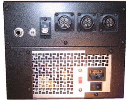
CF2000 Rear Panel