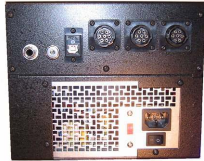
CF2000 Rear Panel