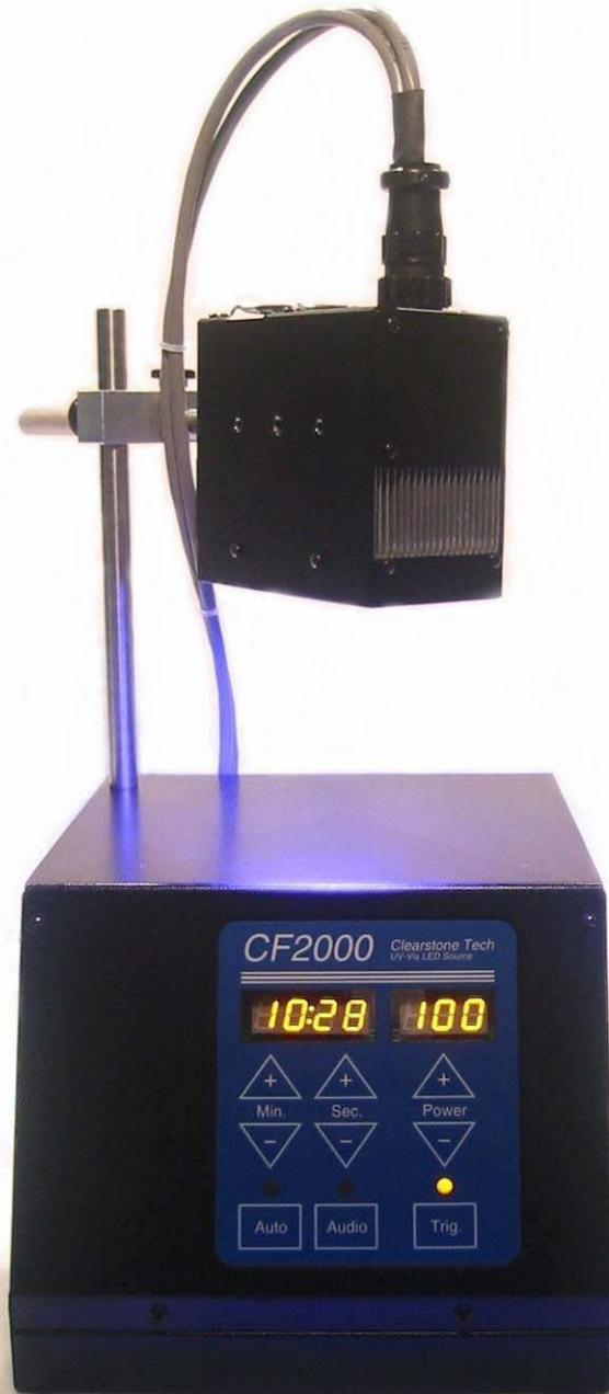
CF2000 shown with JL1 LED head

LED Controller Power Supply USB Remote Operation